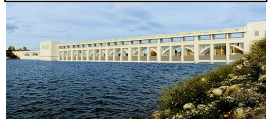
Proposed - Architectural view of the upgraded dam

To Register: Please click HERE or go to the CSEM website: www.csem-scqi.org/calgary.html before noon, Friday April 5th.