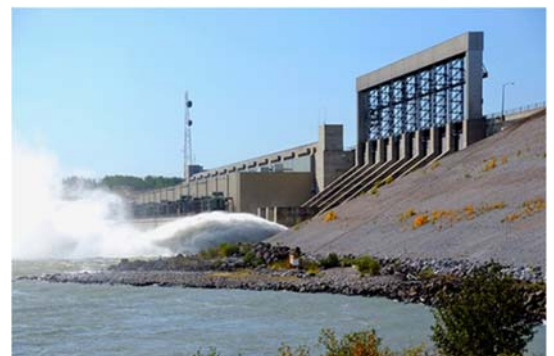
Kettle Station - Spilled Energy