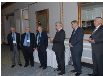
Fellows preparing to be piped into the awards banquet

Thank you to all who attended. We hope you enjoyed your visit to our Queen City!